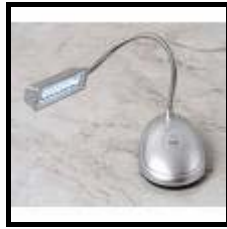
Figure 2 – Lamp

In Brazil, several tile grout manufacturers adopt the term “flexible tile grout” to characterize a type of grout that “efficiently adapts itself to different situations” and, according to product marketing statement, has the ability to sustain stresses and follow expansion and contraction movements caused by weather changes. However, the term has been misused, as a flexible material characterizes itself as being ductile, allowing bending, without rupture, which does not mean that the deformation is of the elastic type, i.e. reversible. A typical flexibility type of plastic deformation can be seen in the lamp (Figure 2) or the microphone (Figure 3) with flexible rod that can be bent or wound according to the position required by the customer and remains static in one position until another one is set.