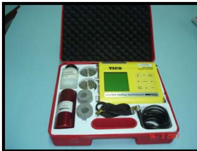
Figure 4 - PUNDIT-Portable Ultrasonic Non-destructive Digital Indicating Tester

In the ultrasound method (figure 4), the modulus of elasticity is determined by the function of the velocity in which the ultrasound wave travels the distance between the two instrument electric pulse transducers (emission and reception), the material density and the Poisson coefficient – in the case of mortars it ranges 0.10-0.20 (CARNEIRO, 1999 apud SILVA; CAMPITELI, 2006). In the case of testing samples, the distance between transducers equals their height.