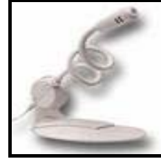
Figure 3 - Microphone